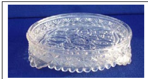
Pictured above left is a 1910 J.B. Higbee Glass Company comport in the Rexford/Alfa pattern. Pictured above right is a Rexford/Alfa tray.

HOSPITALITY: January Committee listed on page 2 BOARD MEETING: Tuesday, January 11, 2011, at the Friendship Masonic Center, 7:00 p.m. ALL MEMBERS WELCOME